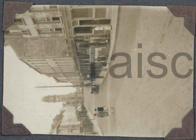
High Street, Enniskillen