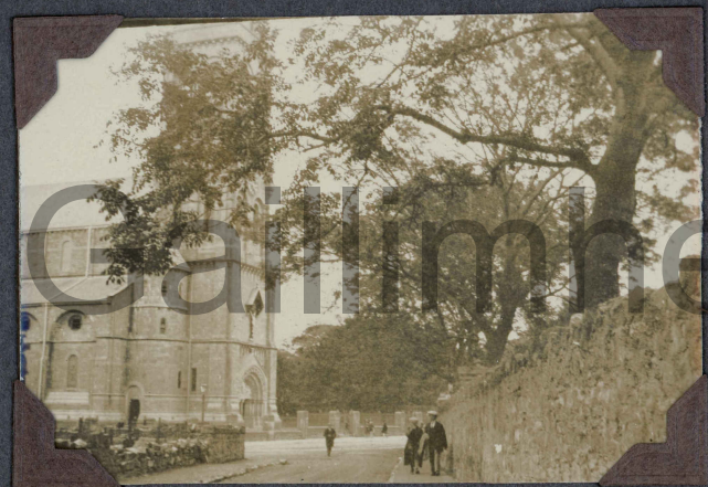
/// Roman Catholic Cathedral, Sligo ///