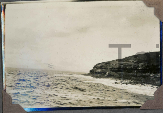
/ Rougey Rocks, Bundoran /