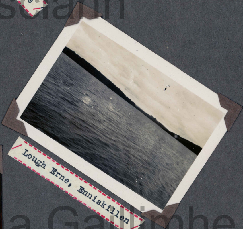
Lough Erne, Enniskillen