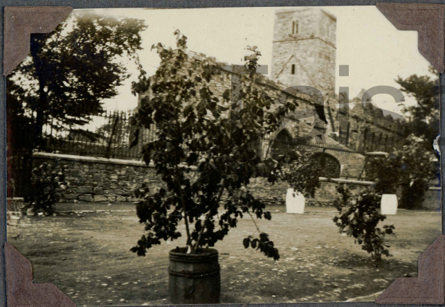
/ Old Abbey, Sligo /