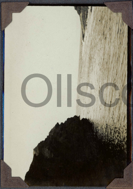
Rougey Rocks, Bundoran