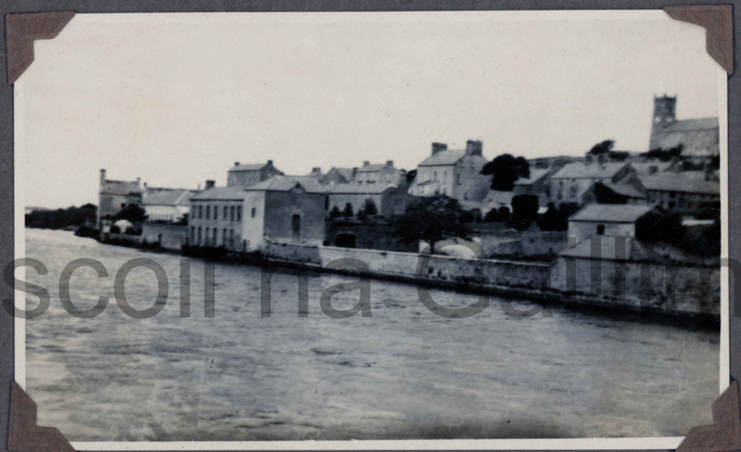
/ Ballyshannon /