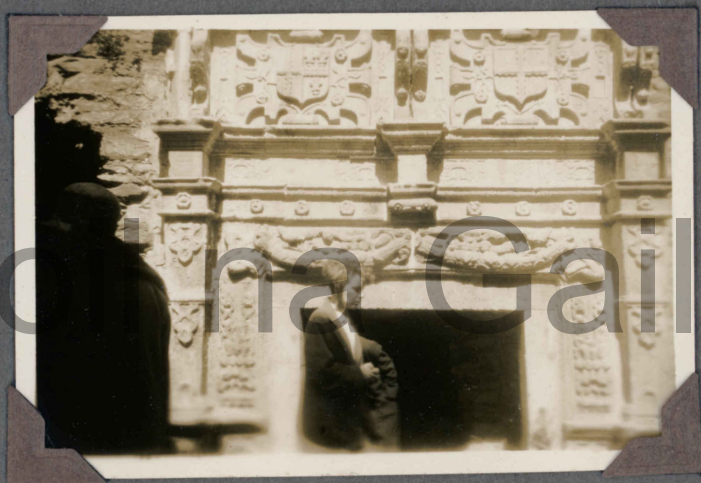
Fireplace in Donegal Castle