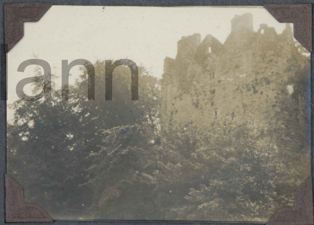
/ Donegal Castle /