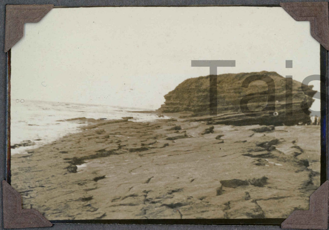
/ Rougey Rocks, Bundoran /