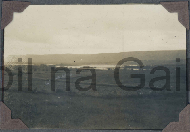
/ Lough Erne, Enniskillen /