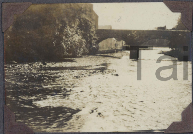
/ At Donegal Town /