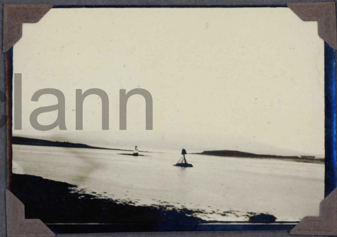
/ Rosses Point, Sligo /