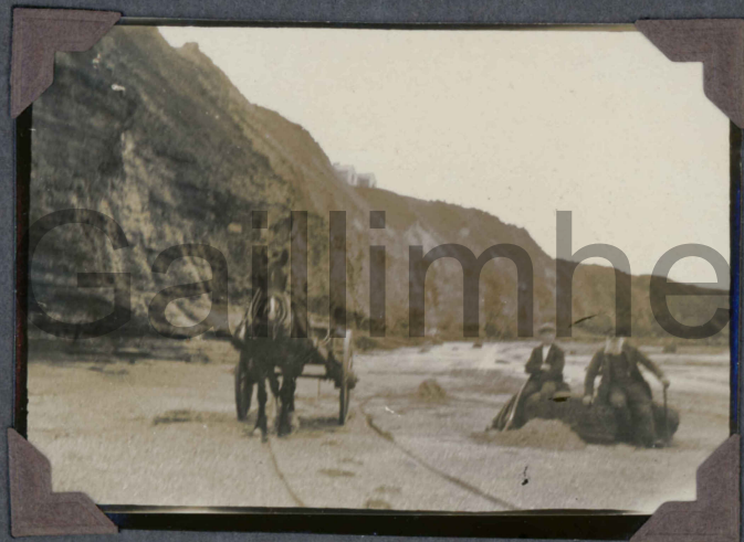
/ Rossnowlagh /