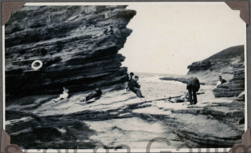
/ Rougey Rocks, Bundoran /