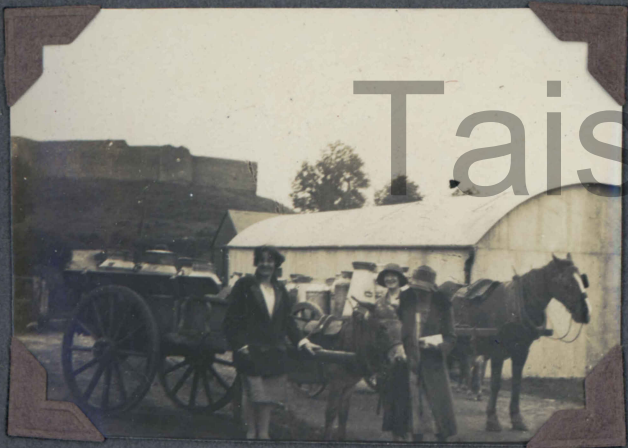
/ Belleek /