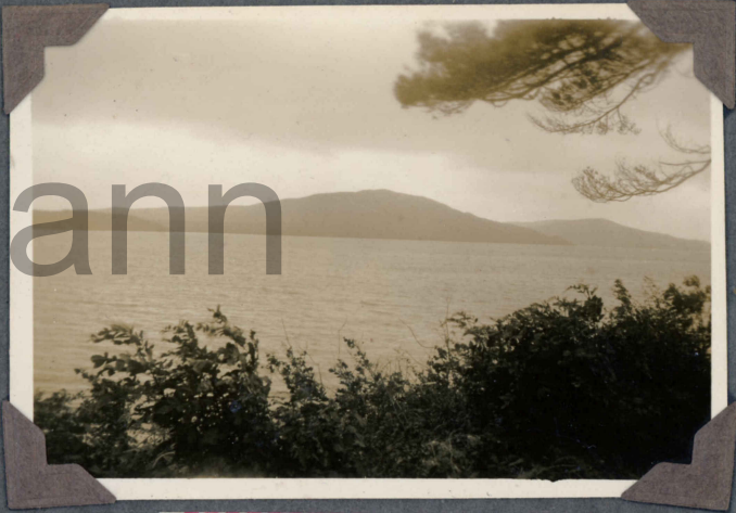
/ Lough Gill, Sligo /