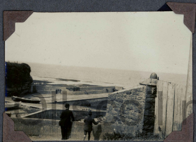
/// Boat Quay, Bundoran ///