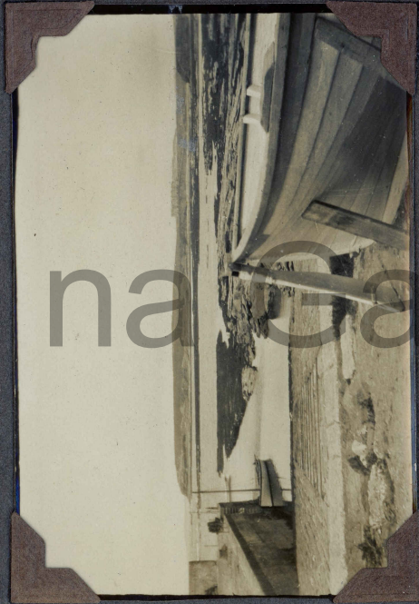
Boat Quay, Bundoran