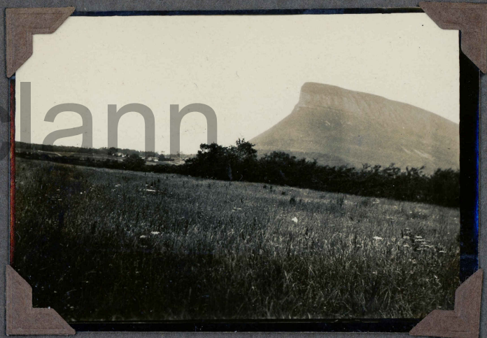
/ Ben Bulbin, Sligo /