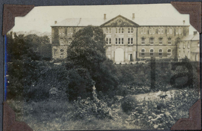
/// Potteries, Belleek ///