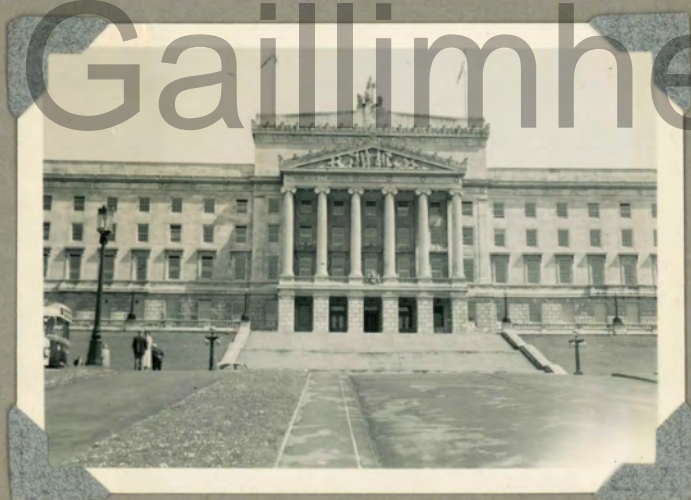
Belfast - Stormont.