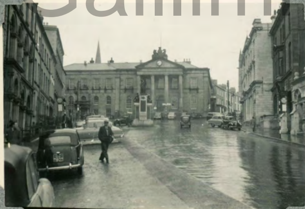
Omagh War Memorial.