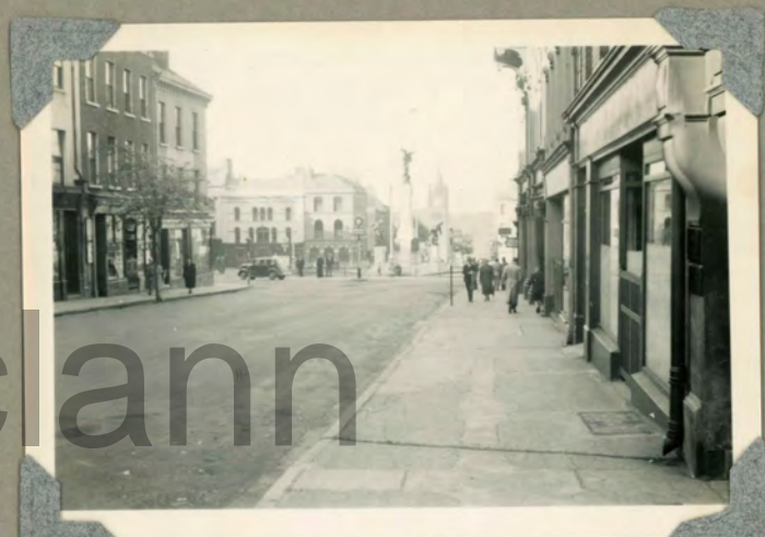
Londonderry - War Memorial and Guildhall.