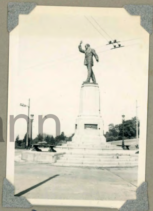
Belfast - Stormont