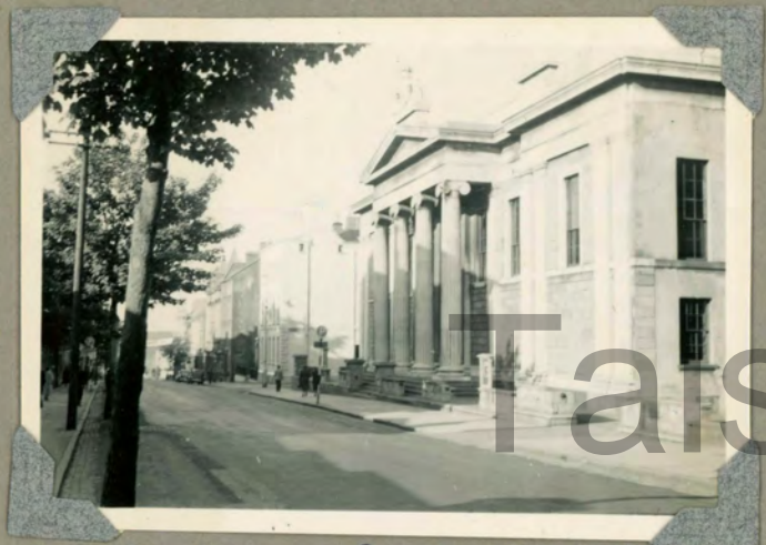
Londonderry - County Council Offices.