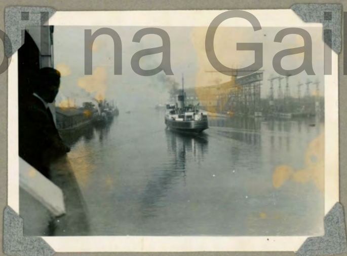
Belfast - Slieve Bernagh and Harland and Wolf Shipyards.