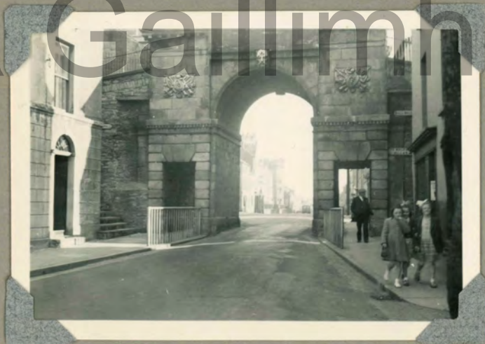
Londonderry - Archway and Gaol.