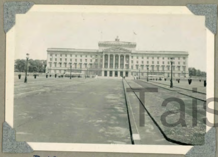
Belfast - Stormont