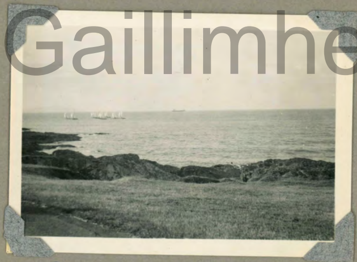
Bangor - Yachts.