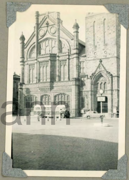
Londonderry Guild hall.