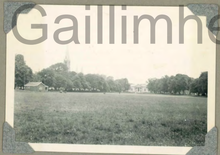
Armagh Presbyterian Church.