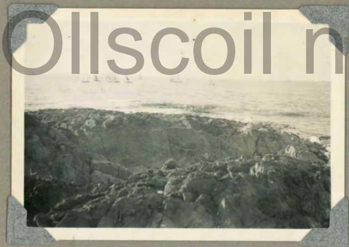
Bangor - Yachts.

Donaghadee - Old Belfast and County Down Coaches used for camping.