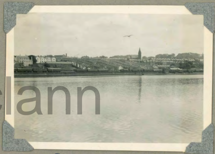
Loch Foyle at Londonderry.