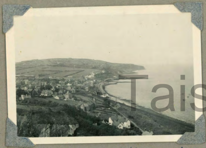
Island Maggee and Whitehead.