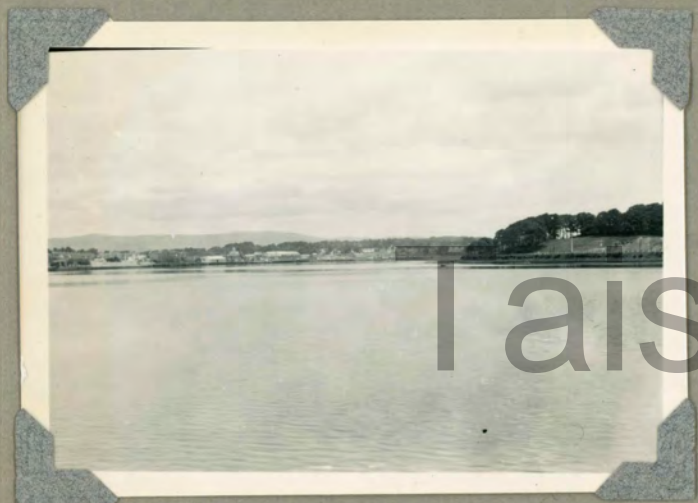
Loch Foyle at Londonderry.