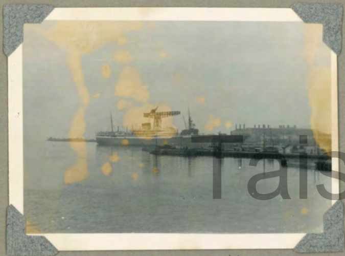
Belfast - Stirling Castle at Harland and Wolf's Shipyard.