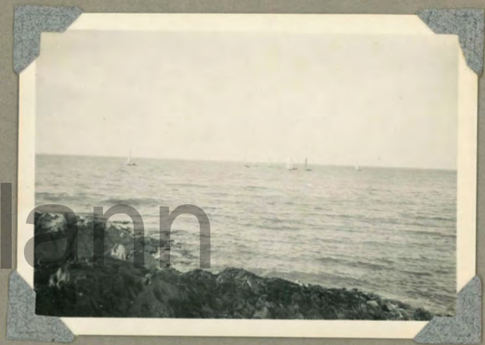
Bangor - Yachts.

Donaghadee - Old Belfast and County Down Coaches used for camping.