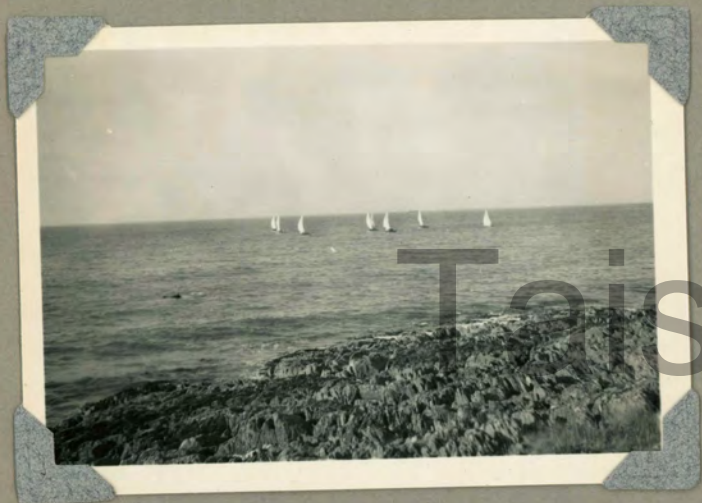
Bangor - Yachts.