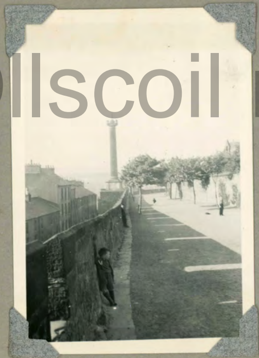
Walker Memorial - Londonderry.