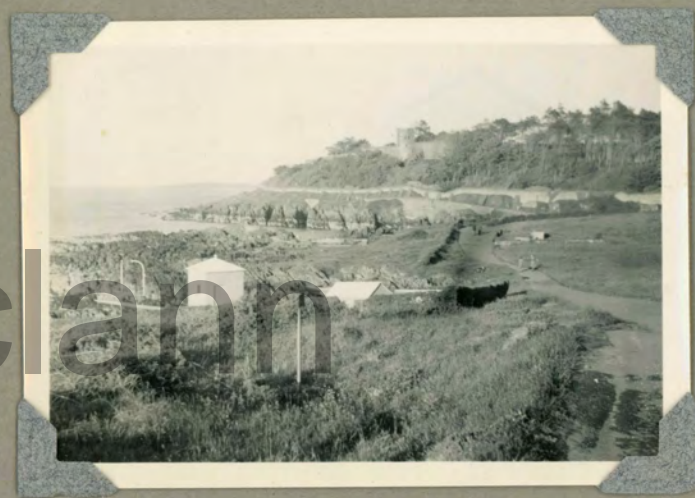
Bangor - Cliff Walk.