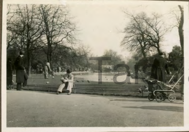
St. Stephen's Green