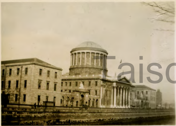
The FOUR COURTS