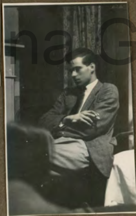
Part of a Party.